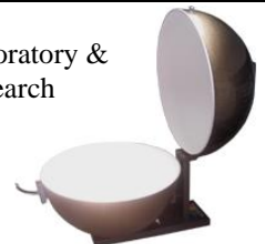
12" Sphere with integrated aux lamp accepts many bulbs & LED array housings