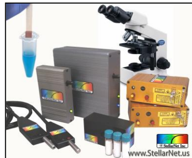
A Universe of Raman Options