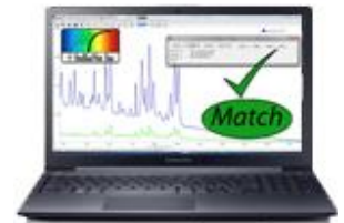
Included SpectraWiz ID Software NEW Database Share Program