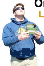
Handheld & Portable